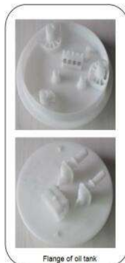
Flange of oil tank