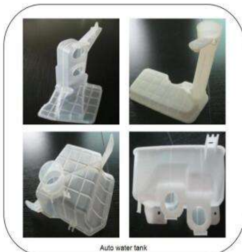
Auto water tank