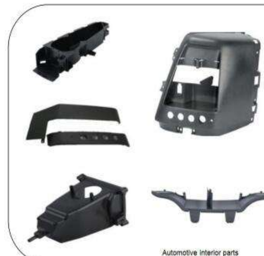
Automotive interior parts