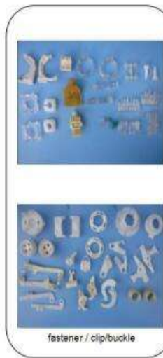
fastener / clip/buckle